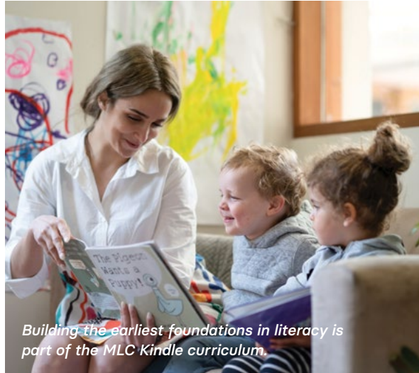
Building the earliest foundations in literacy is part of the MLC Kindle curriculum.