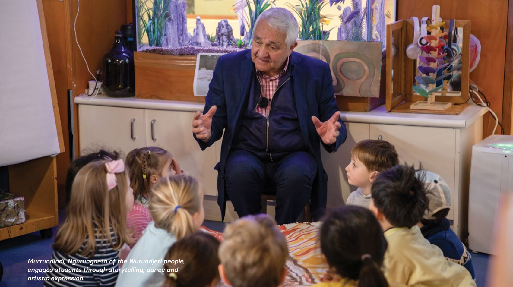
Murrundindi, Ngurungaeta of the Wurundjeri people, engages students through storytelling, dance and artistic expression.