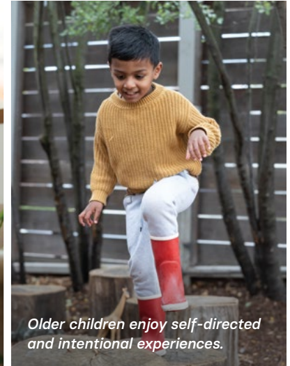
Older children enjoy self-directed and intentional experiences.