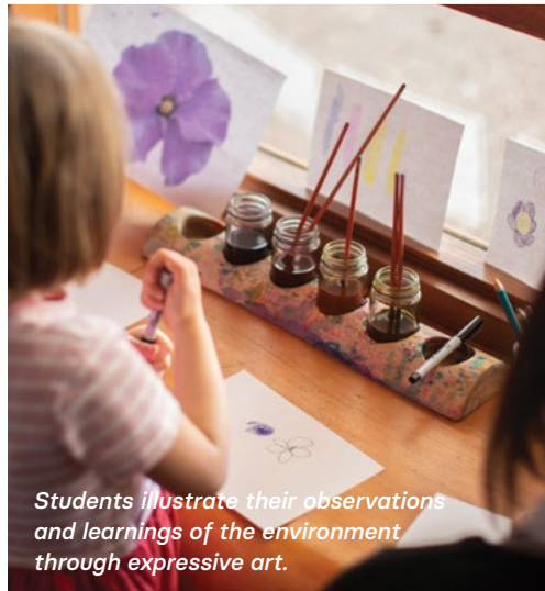
Students illustrate their observations and learnings of the environment through expressive art.